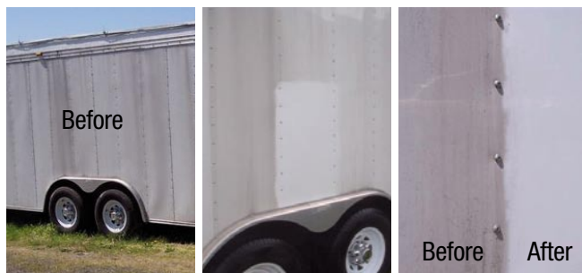
Removes dirt and grime