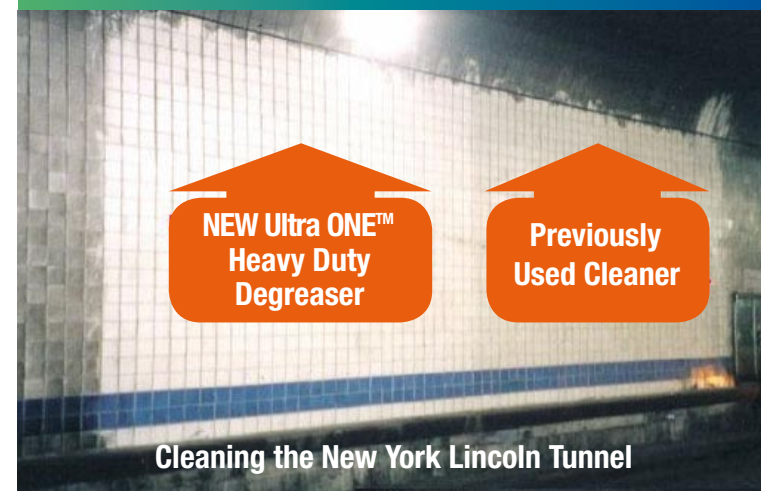
Cleaning the New York Lincoln Tunnel

Meeting and exceeding tomorrow's safety and performance standards today