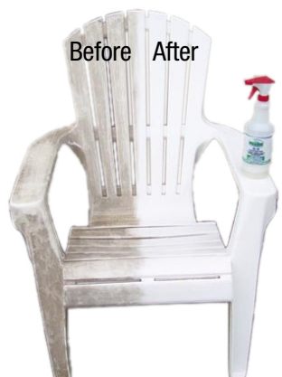
Makes every day jobs easy