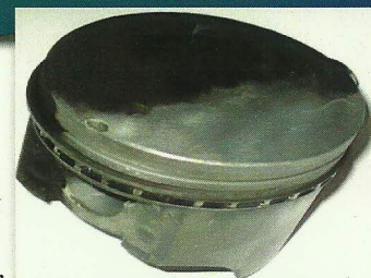
Ultra One dissolves & removes heavy carbon.

Manufactured By: Ultra ONE™ Corp. Edgewater Industrial Park 112 East Avenue Unit 8 • Hackettstown • NJ 07840 T: 908-684-5444 F: 908-684-5455 WWW.UltraONE.COM